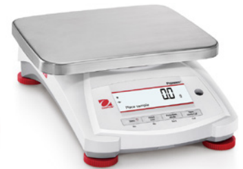
PX12001 and PX12001/E model